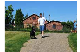
Dog park in Nampa, ID