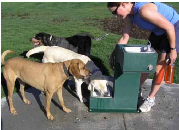
Dog park in Nampa, ID

INTERSECTION WITH EXISTING TRAIL/PATH DOG WALK MAP