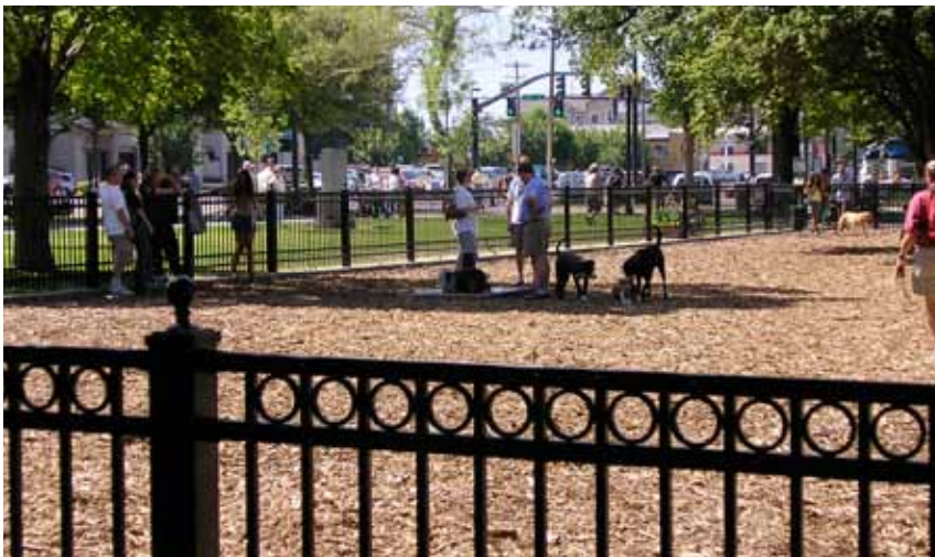
Dog run in Pioneer Park, SLC, UT