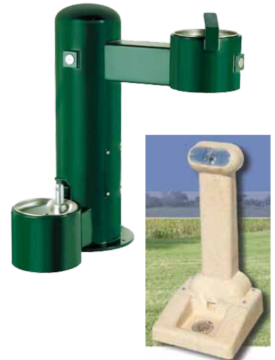
Examples of pet water fountains