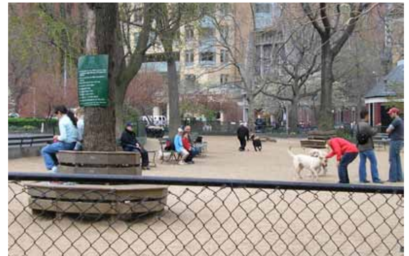
Dog run in Washington Square, NYC