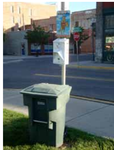
Pet waste stop, Old Town